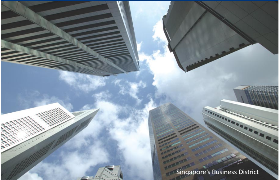
Singapore's Business District

The businessman of today never had it easier. In one compact wired city, he can effortlessly close that deal, travel about hassle-free and enjoy the range of services only a world-class business hub can provide. As the premier Meetings, Incentives, Conventions and Exhibitions (MICE) destination in Asia, you'll also appreciate Singapore's top-notch facilities, excellent infrastructure and attentive staff. Coupled with so many after-hours options for the corporate guest, Singapore makes for a truly unique combination which has won numerous accolades, including the World's Best Business City.