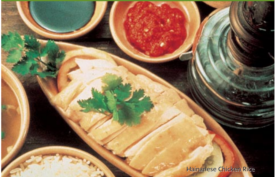
Hainanese Chicken Rice

They don't call Singapore a food paradise for nothing. When it comes to fine dining, whether it is haute French cuisine or a ten-course Cantonese banquet, Singapore is peerless in its diversity. Then there is the entire range of local dishes that are truly unique to Singapore – from fragrant Hainanese chicken rice to fiery Chilli Crab and Peranakan curries. In Singapore, you have endless unique culinary experiences. It all depends on how many meals you can fit in a day!